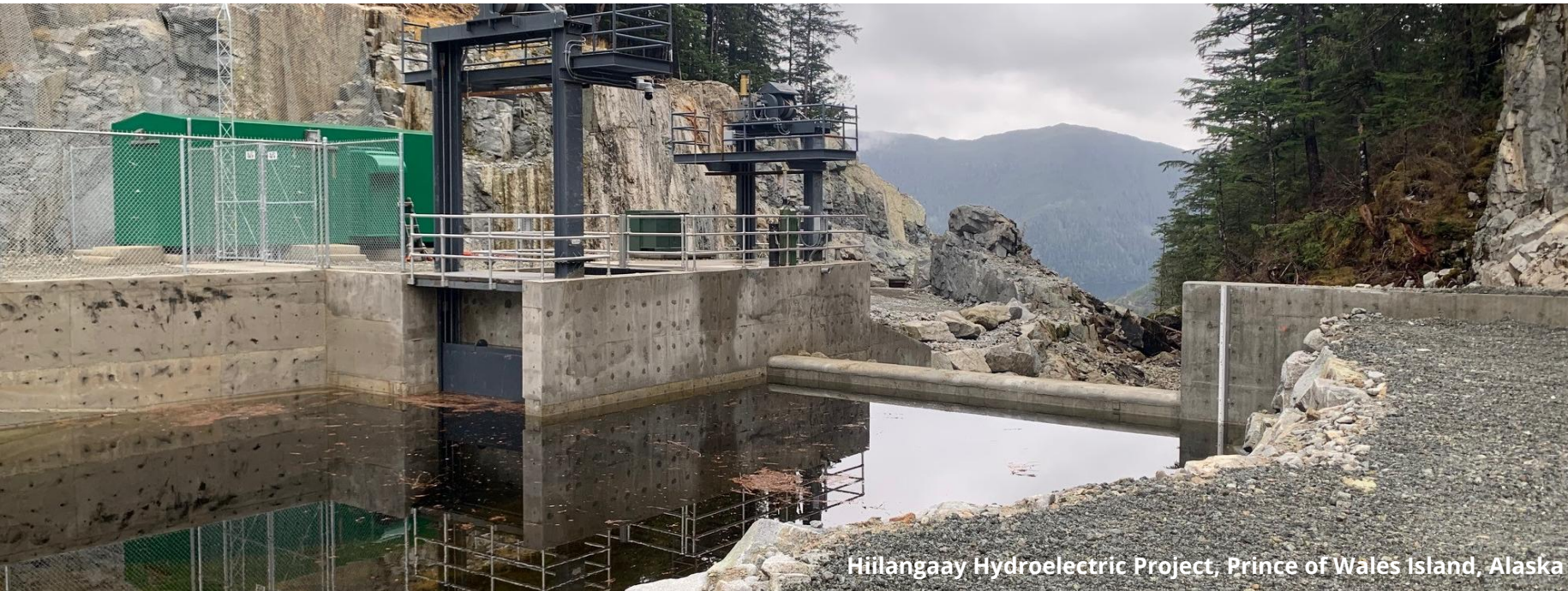
Hiilangaay Hydroelectric Project, Prince of Wales Island, Alaska