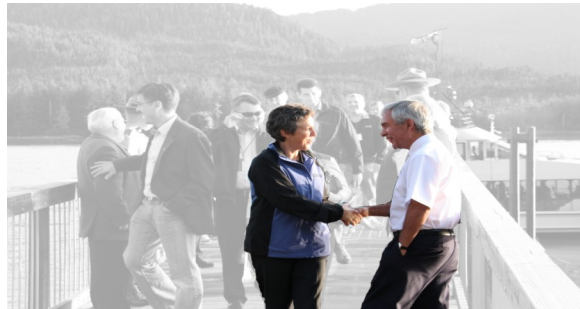
Prince Rupert, City Reception, 2009 Annual Meeting

Here are just a few of the many reasons to become a member of Southeast Conference: