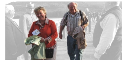
Prince Rupert's City Reception, 2009 Annual Meeting