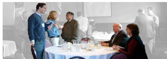
Be Your Own Boss Workshop, March 2008

Today, Southeast Conference is a regional, non-profit corporation that advances the collective interests of the people, communities, and businesses in southeast Alaska. Our members include municipalities, Native corporations and village councils, regional and local businesses, major statewide and national corporations, civic organizations and individuals from throughout the region. Southeast Conference is the State-designated Alaska Regional Development Organization (ARDOR), and the federally-designated Economic Development District (EDD). These designations require Southeast Conference to take an active role in regional resource management and economic development planning.