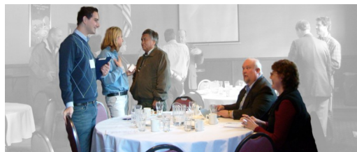
Be Your Own Boss Workshop, March 2008.

Today, Southeast Conference is a regional, nonprofit corporation that advances the collective interests of the people, communities and businesses in southeast Alaska. Members include municipalities, Native corporations and village councils, regional and local businesses, major statewide & national corporations, civic organizations and individuals from throughout the region. Southeast Conference is the State-designated Alaska Regional Development Organization (ARDOR), the federally-designated Economic Development District (EDD), and the federally-designated Resource Conservation and Development Council (RC&D) for Southeast Alaska. Each of these designations requires Southeast Conference to take an active role in regional resource management and economic development planning.