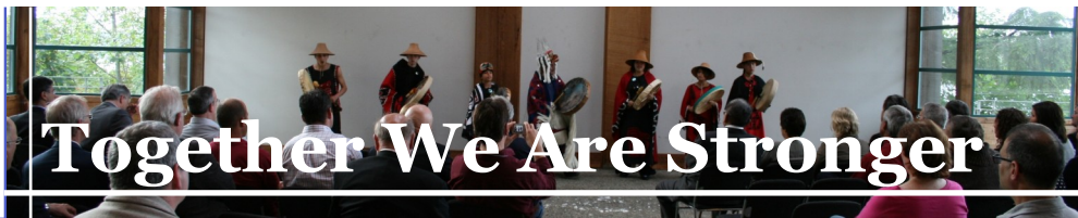
The Gwi's'amiilgigoohl Dancers of the Museum of Northern BC