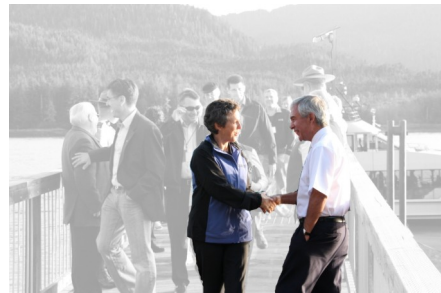
Prince Rupert, City Reception 2009 Annual Meeting.