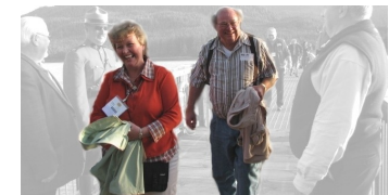
Prince Rupert, City Reception 2009 Annual Meeting.